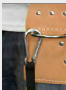
Always use a load bearing anchor or attachment point