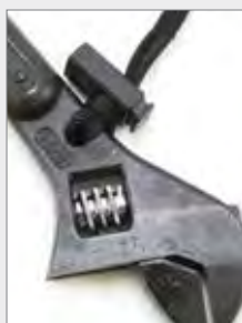
Attach tether through tether hole when available