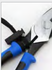
Always use choke hitch formation