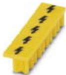
Warning cover, 5-pos., for terminal width: 5.2 mm

Zack Marker strip, flat - ZBF 5 CUS - 0825025